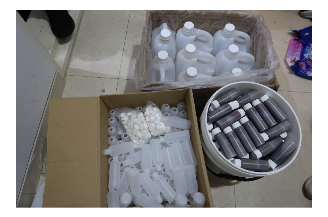
Assortment of medicines found in the condominium unit