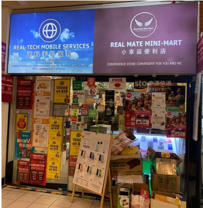
PHOTOS OF E-VAPORISERS AND COMPONENTS SEIZED